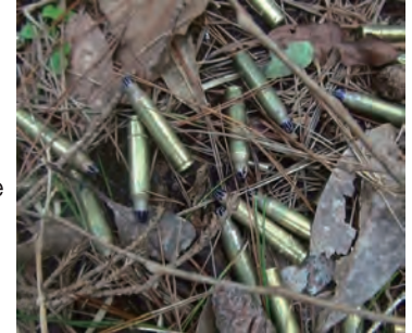
New unused blanks at former Landing Zone-1