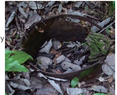
Drums found at former Landing Zone-1, soil surrounding the drums was found contaminated with PCB