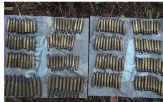
Unused blanks shells found at former Landing Zone-1