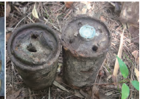
Smoke flares found at former Landing Zone-1